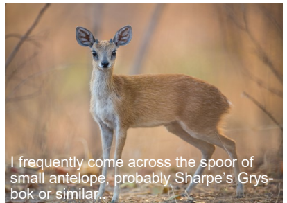
I frequently come across the spoor of small antelope, probably Sharpe's Grysbok or similar.

The outlook down from the office block and classrooms, although not green and beautiful now, holds promise of a spectacular view across the surrounding country.