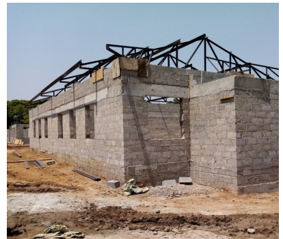
The roof trusses are up, progress!

Velos is a leading property development company well known for excellence and attention to detail.